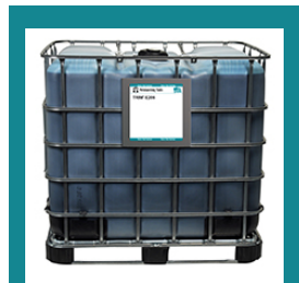
270-gallon tote SKU: E206N/NR270P UPC-12: 641238033882