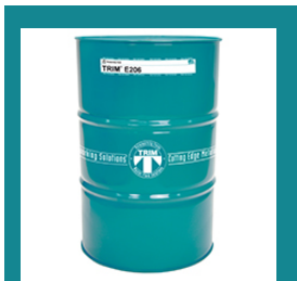
54-gallon drum SKU: E206N/54 UPC-12: 641238003090